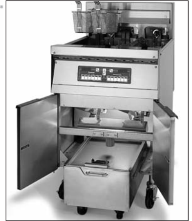
FOOTPRINT III FILTER BASE ASSEMBLIES