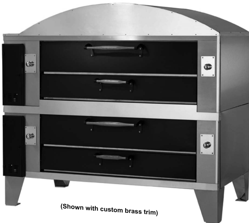
(Shown with custom brass trim)