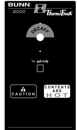
#26178.0002 (½ gallon server)