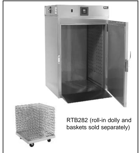
RTB282 (roll-in dolly and baskets sold separately)