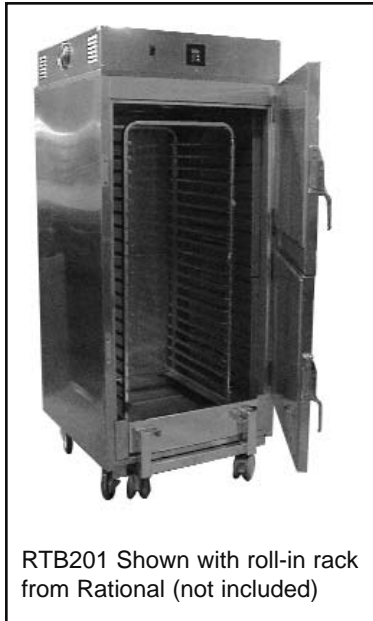
RTB201 Shown with roll-in rack from Rational (not included)