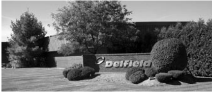
Mt. Pleasant, MI