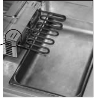
12" x 20" pan correctly positioned in HEAT BASIN, shown with heat tunnel removed.