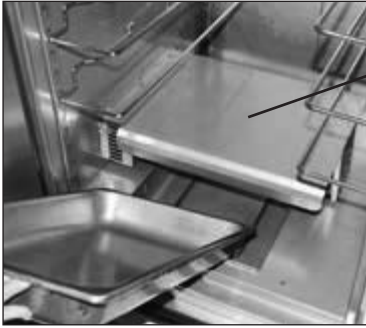
12" x 20" pan is removable and replaceable for easy cleaning.