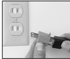
Fig. 7-2 Incorrect