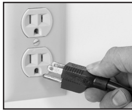
Fig. 7-1 Correct

THIS MACHINE IS PROVIDED WITH A THREE-PRONG GROUNDING PLUG. THE OUTLET TO WHICH THIS PLUG IS CONNECTED MUST BE PROPERLY GROUNDED. IF THE RECEPTACLE IS NOT THE PROPER GROUNDING TYPE, CONTACT AN ELECTRICIAN. DO NOT, UNDER ANY CIRCUMSTANCES, CUT OR REMOVE THE THIRD GROUND PRONG FROM THE POWER CORD OR USE ANY ADAPTER PLUG (Fig. 7-1 and Fig. 7-2).