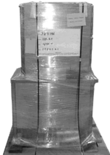
Beneath the heavy carton, the unit will be wrapped in protective plastic on a heavy skid.