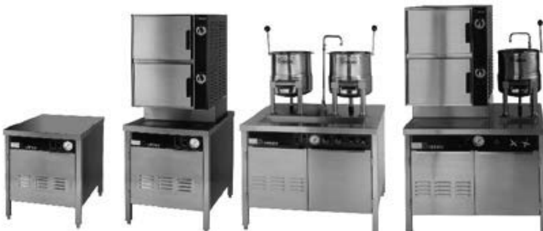
The NEB-1 Boiler may be used for a variety of applications in a variety of combinations.

[SEE OM-HY-6CAV FOR STEAMER CAVITY OPERATION AND/OR OM-TD FOR KETTLE OPERATION.]