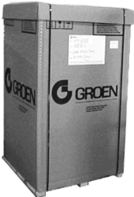
Unit will arrive in a heavy carton, mounted on a skid.

When installation is to start, cut the straps and lift the unit straight up off the skid.