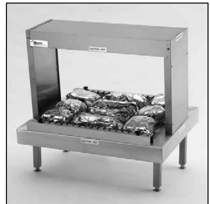
SW-2418 Sandwich Warmer

Merco Savory, LLC 1111 North Hadley Road Fort Wayne, Indiana 46804 United States of America Technical Support Hotline: (800) 678-9511 Telephone: (260) 459-8200 www.mercosavory.com