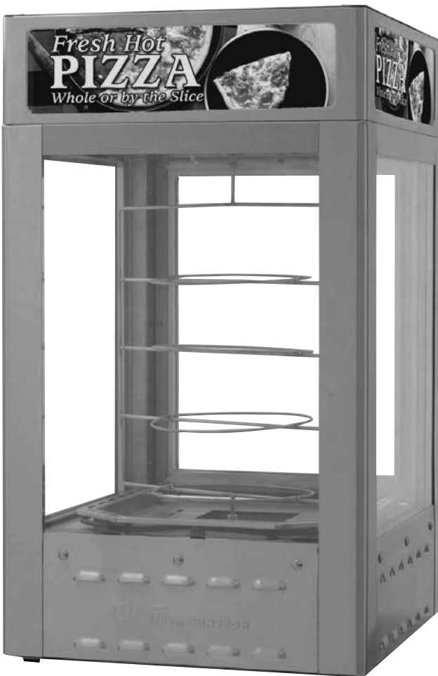
MGB007 (Shown with optional lighted sign and rotating racks.)